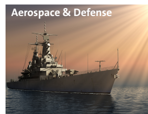
Aerospace & Defense